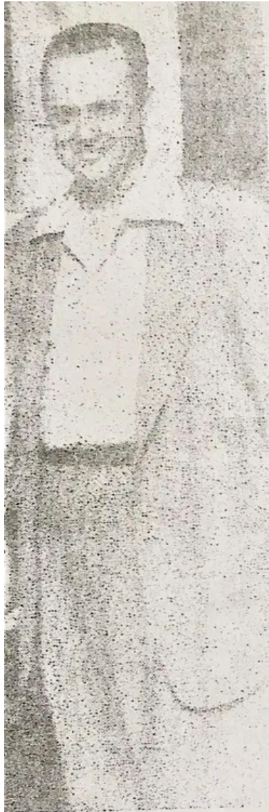
at the Fairgrounds, pending y by owners of the firm shown Company is shown center, with easurer.