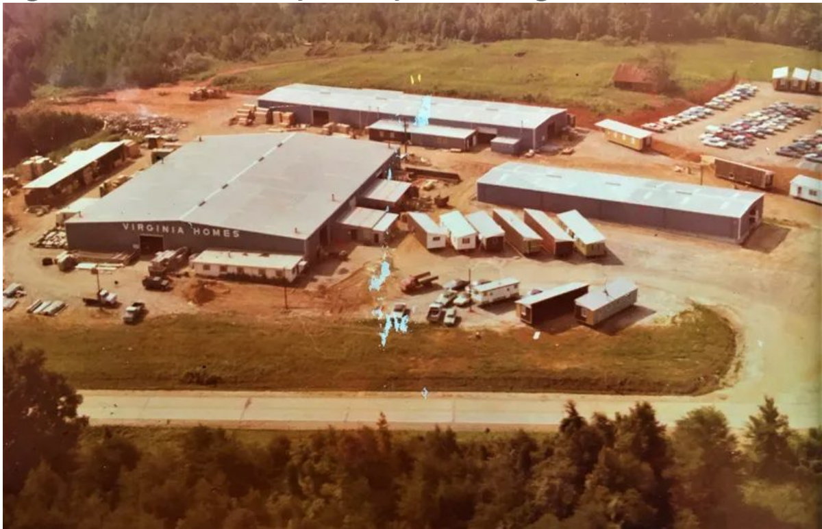
Virginia Homes of Boydton