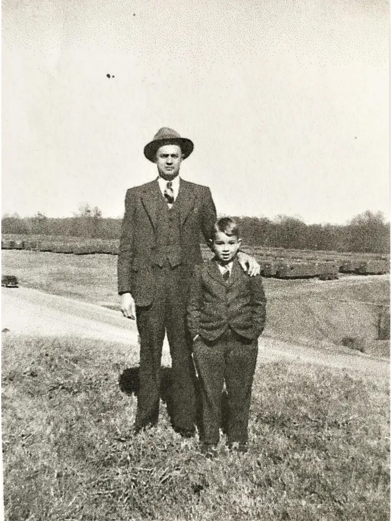
Units in the background were shipped to Army bases during World War II